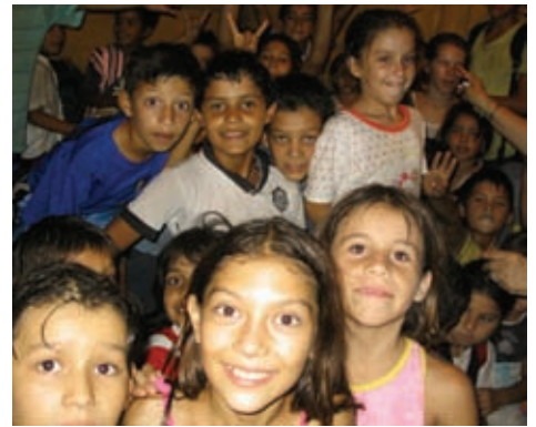
Hardworking pastoral couples are the heart of compassionate church action to poor children with little support.