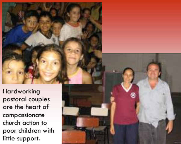
Hardworking pastoral couples are the heart of compassionate church action to poor children with little support.

Compassionate Church Action—Two pastoral couples have been reaching out to feed children and offer them love, hope, and life training. At Tablada Novena, one of these couples have been working with what little they have. The building they use leaks when it rains. They've been feeding poor aboriginal children in slums weekly for 10 years, and this meal is often the best food the children get all week. Most of these children are also in poor health. The couple work in Zebollod, a different region of Asuncion, and through the church are able to offer twice daily meals and daily school classes to poor children. They are bursting at the seams, and have the capacity to expand their building to handle more students, but they need funding.