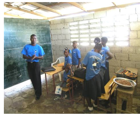
Current classroom conditions