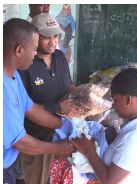
Aid distribution at Nehemiah Project school in Chambrun. Up to 700 people received food, clothing, and hope!